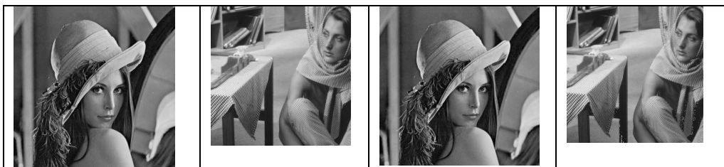
Figure 2. (a) Original Lena cover image ( 512 \times 512 ), (b) Original Barbara Secret image ( 389 \times 389 ) (c) Stego Lena image that has image (b) inside it, and (d) Recover image from (c)

The proposed approach is implemented in MATLAB 7.0. The cover image is decomposed into two levels using Haar wavelet. Embedding Factor ( EF ) is used to balance the embedding effect. It is better to use the lesser value of EF , so e^{-n} ( e is base of natural logarithms) is used where n is a positive integer such as n \geq 2 . Some of the images considered are shown in Figures 2-4.