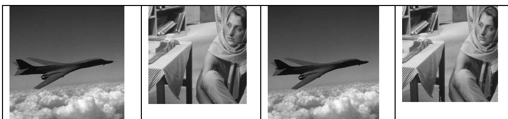
Figure 4. (a) Airplane image ( 512 \times 512 ), (b) Original Barbara Secret image ( 433 \times 433 ) (c) Stego airplane image after embedding Barbara image, and (d) Recover Barbara image.